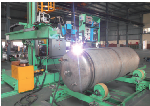
Auto welding machine used to weld at our factory in Neemrana, India

Compared to carbon steel, stainless steel is more difficult to weld. Hot water storage tanks (pressure vessels) that have badly done welds can break under pressure. Weld technology is the key. BELTECNO uses automatic welding machines, based on advanced welding technology we developed ourselves. Our factory in Neemrana, India also uses an automatic welding machine to manufacture, as is used in Japan. That is why we provide durable Stainless Steel Cylindrical Tanks that look beautiful and, most importantly, do not leak.